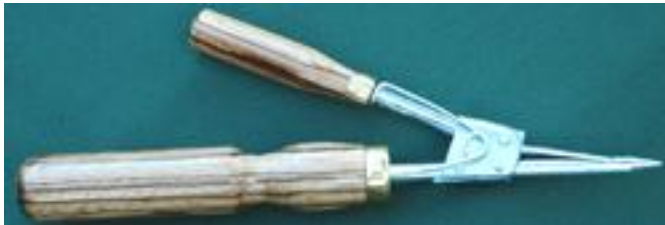
Price: £15.00 plus p&p

Exotic Wood Handle Spring Hook (shown here with a straight-grip handle) High quality exotic wooden handled rug maker's spring hook for making proddy mats without a frame.