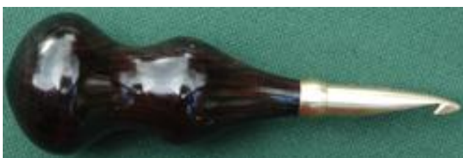
Prices: Steel £12.00 plus p&p Brass £13.00 plus p&p

Comfygrip Hook (only the one shape and size of handle available, various woods) Unique design rug maker's hook – various exotic woods.