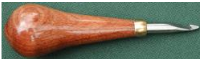
Price: £12.00 plus p&p

Ideal for velvets, t-shirt fabrics, 1/4" width cuts of fabrics and all lighter-weight fabrics.