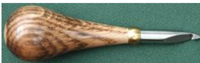
Price: £12.00 plus p&p

Ideal for 1/2" cut sweaters, blankets, tweeds and all heavier fabrics.