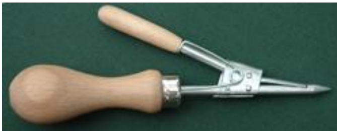
Price: £12.00 plus p&p

Spring Hook (shown here with a medium-grip handle) Plain wooden handled rug maker's spring hook.